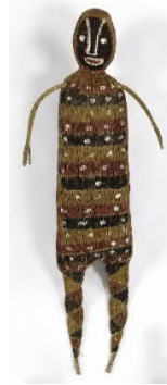
Lena Yarinkura Yawkyawk 2003, ochre paint on natural fibres (twined Pandanus)