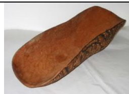
Topsy Tjulyata Piti – Collecting Bowl 2000, wood