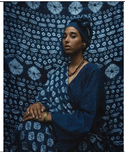
Tabita Rezaire Omu Elu , 2024 Exhibition view: Tabita Rezaire. Calabash Nebula: Cosmological Tales of Connection