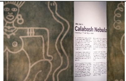
Tabita Rezaire Omu Elu , 2024 Exhibition view: Tabita Rezaire. Calabash Nebula: Cosmological Tales of Connection